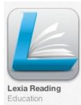
Figure 1 Lexia Reading iPad App