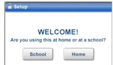
Figure 2 Setup Screen