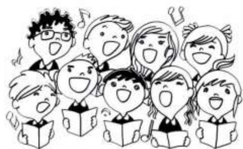
La Fontaine Academy's Year 3 and Year 4 Choir

We are currently reviewing how often PE kits should go home. As there are a large number of children who often forget to bring their PE kits to school, like many other schools, we are considering keeping PE kits in school longer, only sending them home twice or three times per half-term.