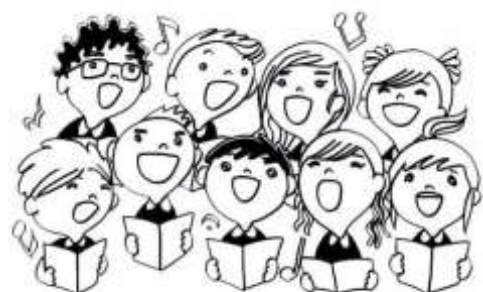
La Fontaine Academy's Year 3 and Year 4 Choir

This, we hope, will help us ensure that ALL children take part in ALL PE lessons, as expected.